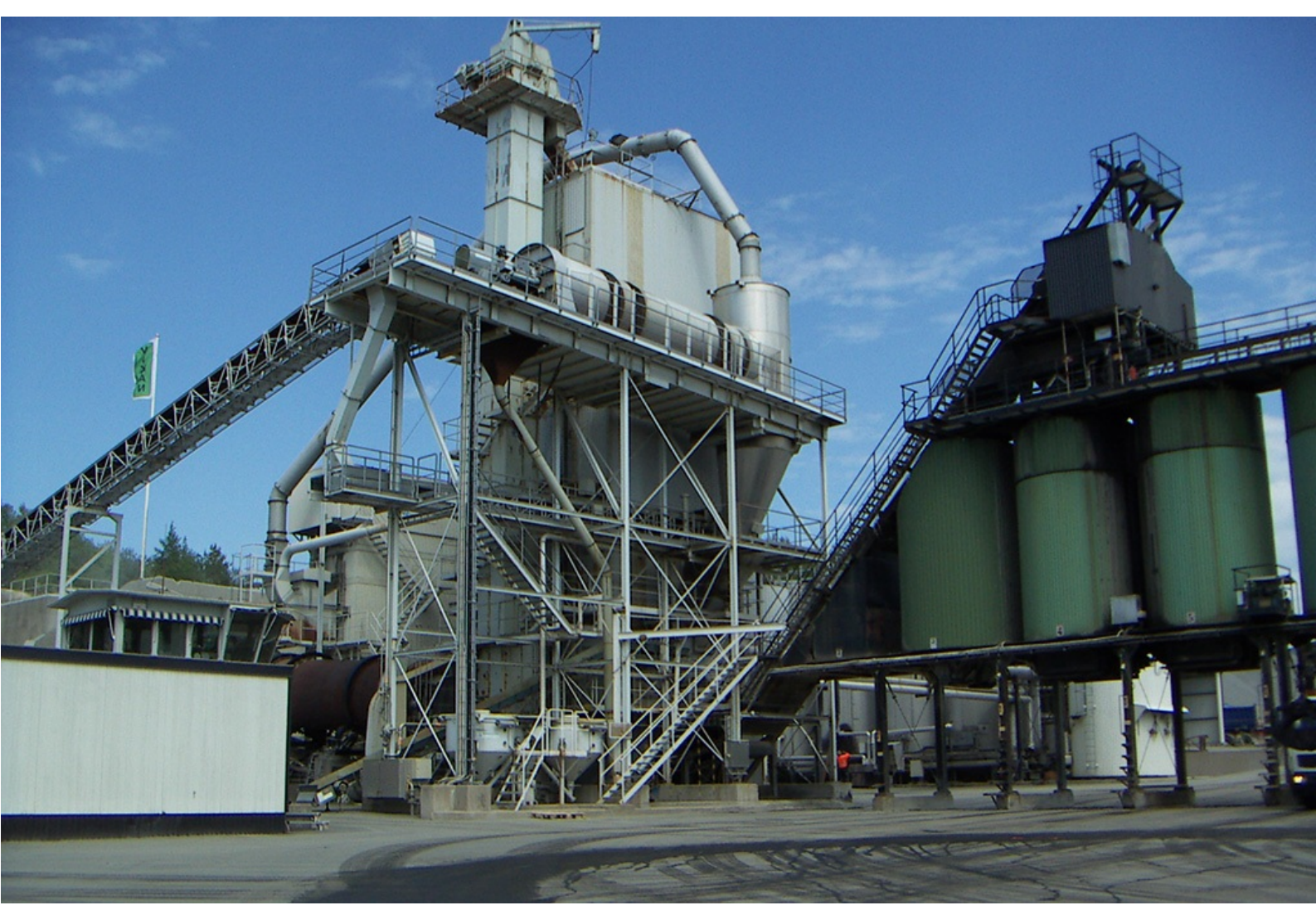
ABb PMB, Skanska Industrial Solutions, Vikans Asfaltverk

in accordance with ISO 14025 and EN 15804+A2