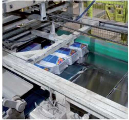
Figure 1: production process detail

The production process starts from raw materials, that are purchased from external and intercompany suppliers and stored in the plant. Bulk raw materials are stored in specific silos and added automatically in the production mixer, according to the formula of the product. Other raw materials, supplied in bags, big bags or tanks, are stored in the warehouse and added automatically or manually in the mixer. The production is a discontinuous process, in which all the components are mechanically mixed in batches. The semi-finished product is then packaged, put on wooden pallets and stored in the finished products warehouse. The quality of final products is controlled before the sale.