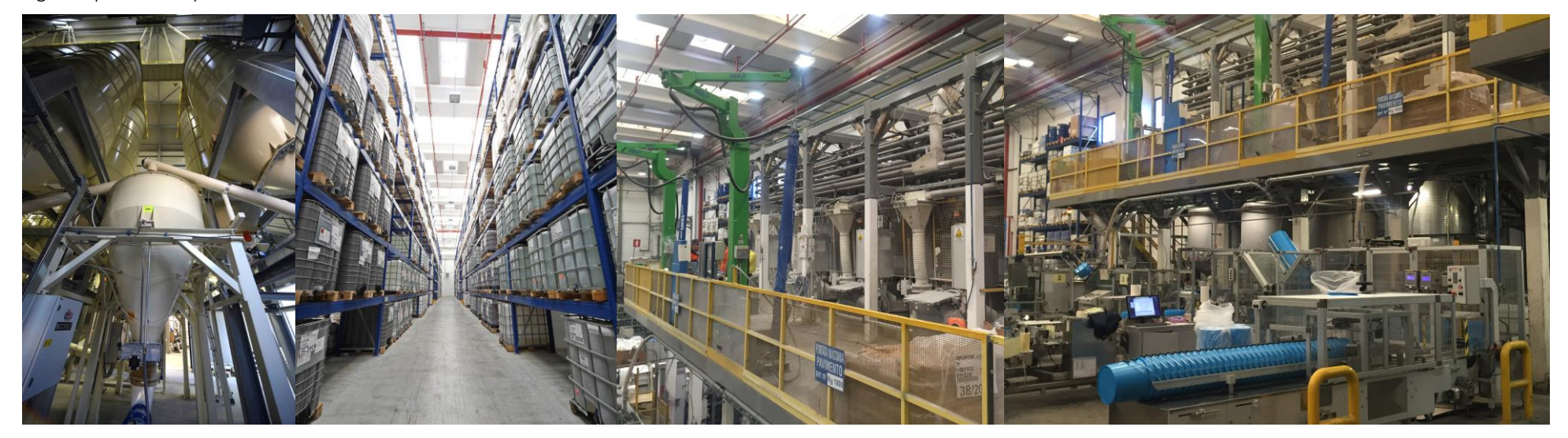
Figure 1: production process detail

The production process starts from raw materials, that are purchased from external and intercompany suppliers and stored in the plant. Bulk raw materials are stored in specific silos and added automatically in the production mixer, according to the formula of the product. Other raw materials, supplied in bags, big bags or tanks, are stored in the warehouse and added automatically or manually in the mixer. The production is a discontinuous process, in which all the components are mechanically mixed in batches. The semi-finished product is then packaged, put on wooden pallets and stored in the finished products warehouse. The quality of final products is controlled before the sale.