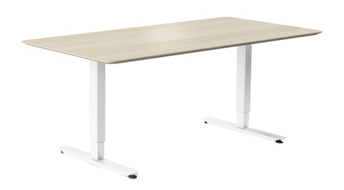
Table top 140x90 birch veneer

in accordance with ISO 14025 and EN 15804+A2