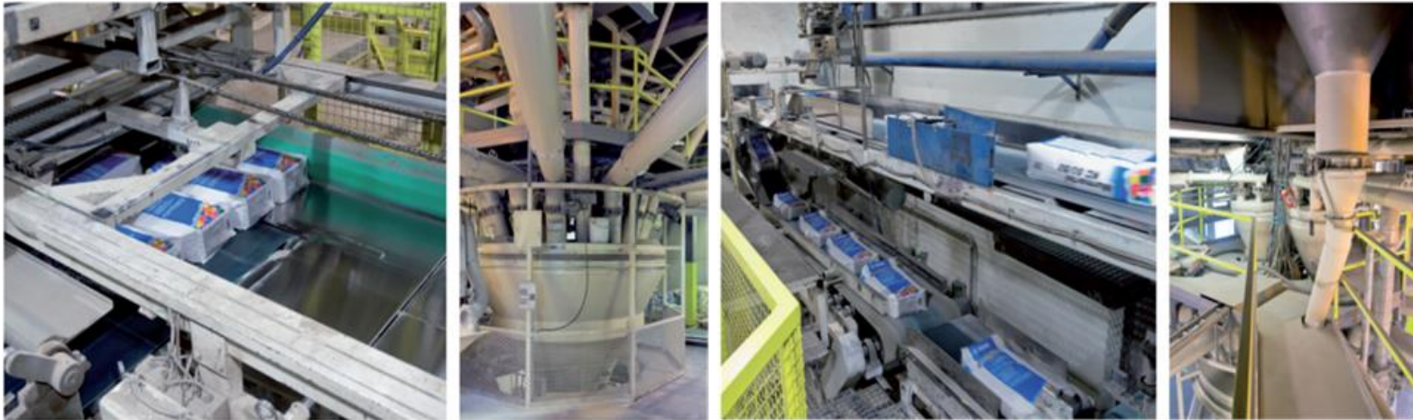
Figure 1: production process detail

The production process starts from raw materials, that are purchased from external and intercompany suppliers and stored in the plant. Bulk raw materials are stored in specific silos and added automatically in the production mixer, according to the formula of the product. Other raw materials, supplied in bags, big bags or tanks, are stored in the warehouse and added automatically or manually in the mixer. The production is a discontinuous process, in which all the components are mechanically mixed in batches. The semi-finished product is then packaged, put on wooden pallets and stored in the finished products warehouse. The quality of final products is controlled before the sale.