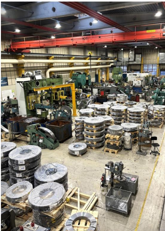
Production at Spilka